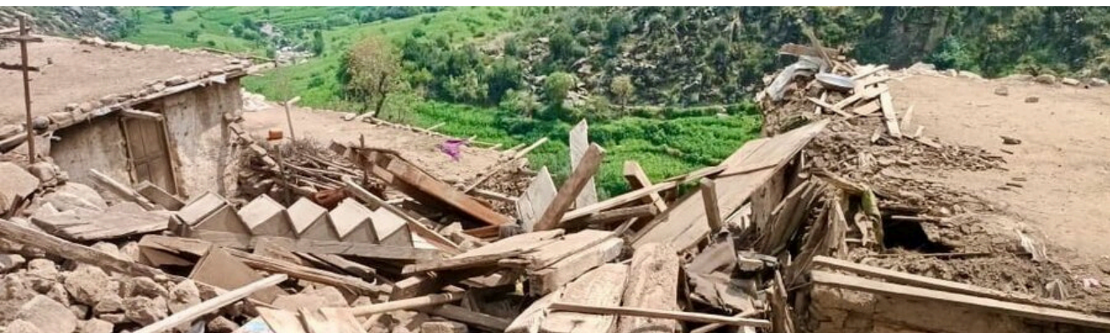
The earthquake has led to huge scale destruction of homes and public infrastructure. Humanitarian actors provide first aid and relief - but reconstruction needs to start now. We thank WFP for sharing this picture, copyright WFP/Aslam Haiderzai

While humanitarian partners are mobilizing immediate relief efforts with local authorities, efforts to reconstruct and build back better must start now, in parallel to the emergency response. Without timely shelter and housing interventions, vulnerable displaced families—particularly women, children, persons with disabilities, and the elderly—will face unimaginable hardship during the coming winter.