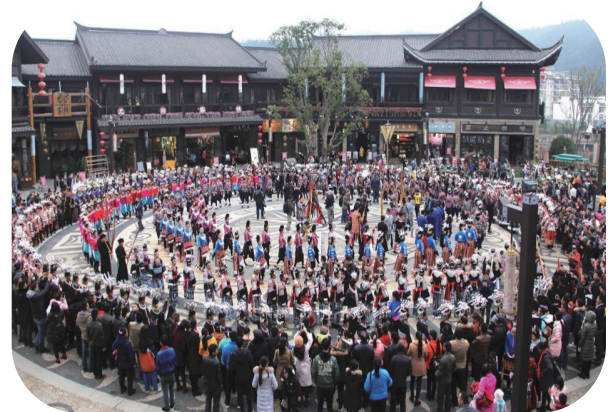
Danzhai Wanda Village(Qiandongnan Prefecture, China)