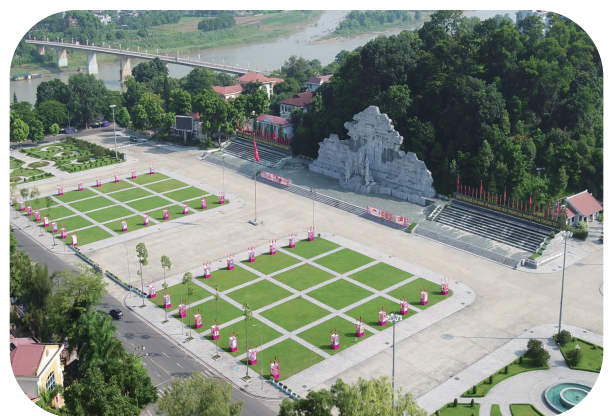
Nguyen Tat Thanh Square ~ Quintessence of the Mountains ~ (Tuyen Quang, Vietnam)