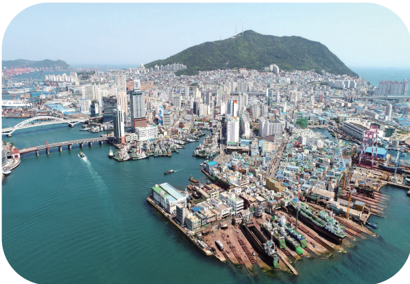
A New Way to Walk the Old City, Yeongdo Modern History Trail Map (Busan, Korea)