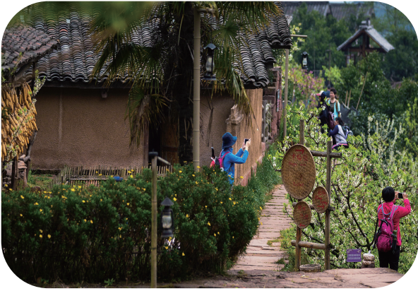
Xingfu Ridge( Ecological Homestay Settlement in Xingfu Ancient Village ) (Meishan,China)