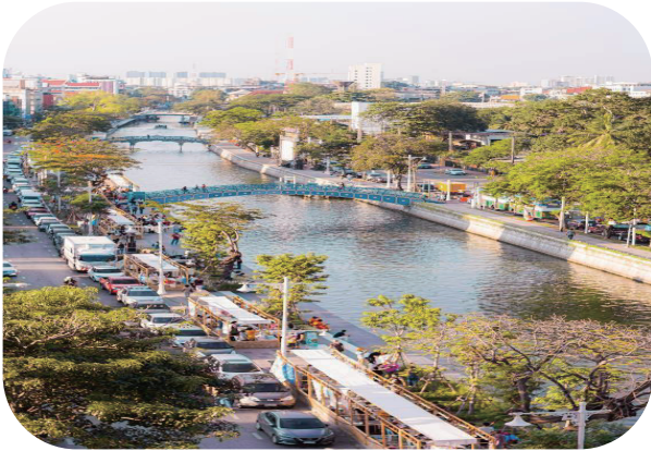
Public Landscape for Urban Renewal of Phadung Krung Kasem Canal (Bangkok, Thailand)