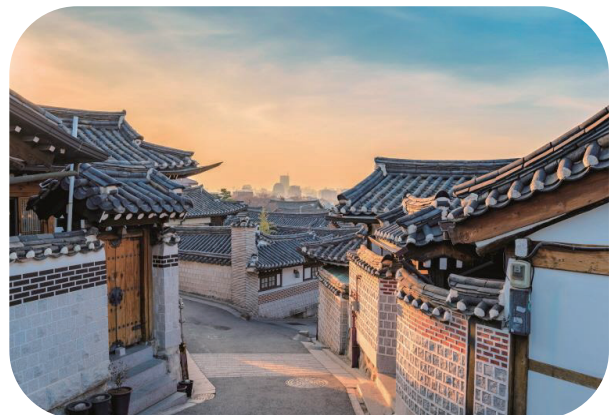
Balanced Urban Development through the Recovery of Historical and Cultural Landscape “Hanok Preservation and Promotion Policy of Seoul” (Seoul, Korea)