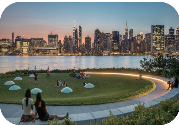
Environmental Landscape Improvement Planning for Yangtze River Waterfront in Jiangbei New District of Nanjing (Nanjing, China)