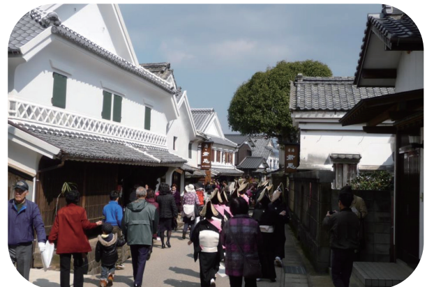
Town Planning to Preserve the Historical Townscape of Hizenhama-shuku (Kashima, Japan)