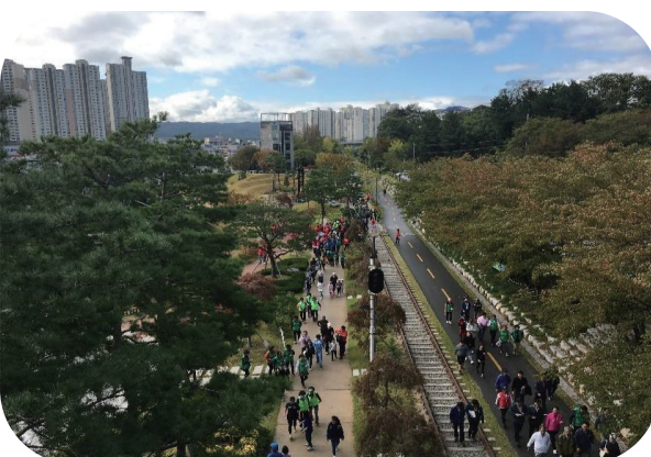
Add Roads and Forests to the Iron City (Pohang, Korea)