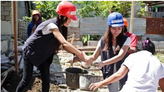
Employees of the BDO Foundation, which is funding a multipurpose center in the community of Milibili, Roxas City, volunteer in the center's initial construction work.

In Tacloban City, which carries the highest number of deaths from Haiyan, a commemorative walk from the city astrodome and through the city streets was followed by a candlelight memorial where thousands of candles were lit to cover over 10 kilometers in distance from the airport to the village of Nula Tula. In the afternoon, 500 commemorative sky lanterns were launched at the Balyuan Grounds, followed by a concert by the city's bands and musicians and activities from several organizations' booths.