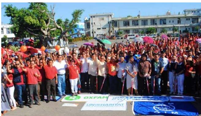
UN-Habitat and other representatives from international and national organizations as well as the local government gathered in Ormoc to commemorate Haiyan's first anniversary.

In the port city of Ormoc, people gathered at the city stage for prayers and a series of memorial ceremonies that included church bell ringing, blowing of horns, releasing of doves and white balloons, and the launch of a motorcade both in remembrance of the city's departed and as a symbol of the city's resilient spirit and hope.