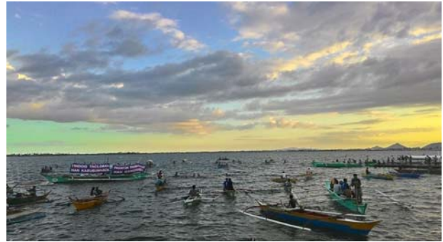
A sunset boat parade, some carrying banners depicting messages on resilience and recovery