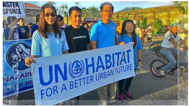
UN-Habitat joins Tacloban's memorial walk.