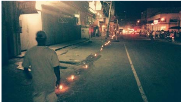
A candlelight path in memory of citizens that Tacloban lost to the storm