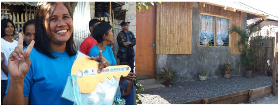
A number of corehouses were handed over to their new owners as part of commemorative activities for the Haiyan anniversary. May families hope to be moving into their new homes by Christmas.

Over on Panay Island, activities running from Estancia in Iloilo Province to several parts of Roxas City in Capiz Province included a photo exhibit by various humanitarian and development agencies documenting their post-Haiyan work, a volunteer day for the construction of a multipurpose center in one of the communities badly hit by the typhoon, and a turnover of a number of corehouses to beneficiary households as output of the ongoing Post-Yolanda Support for Safer Homes and Settlements (a joint project of UN-Habitat, the Government of Japan, and several local government partners).