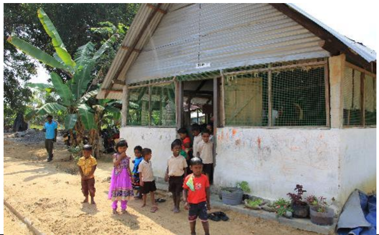
The current temporary preschool building

The initial resettlement period posed major difficulties as families had to restart their lives without basic infrastructure facilities such as permanent housing, water supply, road networks and public buildings. When UN-Habitat commenced the RCI project, a Community Action Planning Workshop was conducted to identify critical infrastructure needs of the village. The residents identified several urgent needs including the rehabilitation of an internal access road and storm water drainage system, a preschool, community study hall and marketplace. The preschool was selected by the residents as the main priority as the current preschool was functioning in a temporary building with minimal facilities.