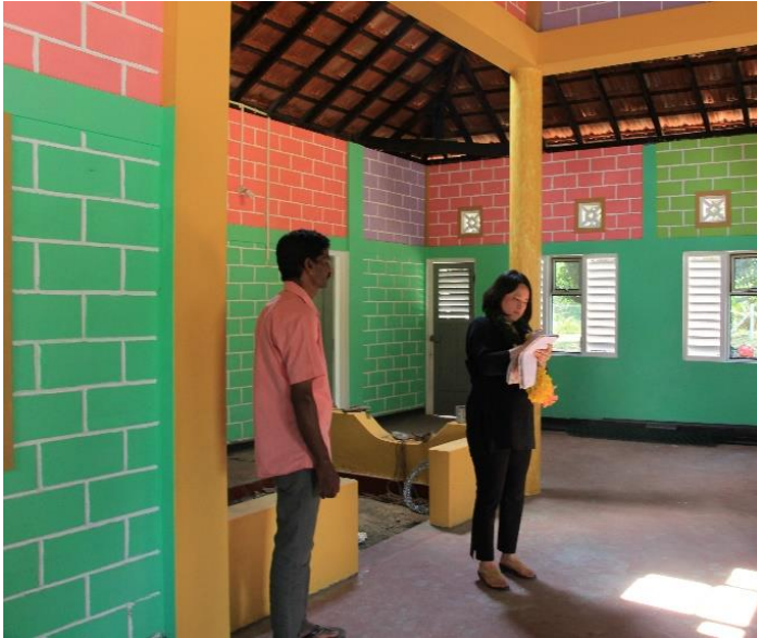
UN-Habitat Officer inspecting construction progress of Vallipunam Ramesh preschool in Mullaitivu

The Project for Rehabilitation of Community Infrastructure, Improvement of Livelihoods and Empowerment of Women in the Northern and Eastern Provinces (RCI) is a community infrastructure development project, contributing towards the sustainable rehabilitation and reconstruction of the conflict affected Northern and Eastern Provinces. Funded by the Government of Japan and implemented by UN-Habitat, the project supports returned and resettled Internally Displaced Persons (IDPs) to overcome their on-going hardships, exacerbated by the lack of basic services. Key project interventions include the construction of community centres, preschools, internal access roads, storm water drainage systems and community storage units.