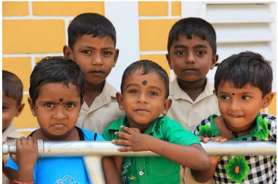
Little pre-schoolers eagerly await the opening of their new preschool

A total of LKR. 3,218,278 was spent on the construction of the preschool. With construction commencing in July 2015, the preschool is now nearing completion. It is 1,070 square feet with a large classroom, teacher’s room, kitchen and toilets (See Type Plan 1 below for details). The entrance to the preschool includes a ramp to provide disability access. The preschool will have a small playground with sand and water ponds for children’s play activities. The preschool has been constructed with cement blocks for walls and clay roofing tiles for the roof. To save precious timber resources, cement precast window frames and grills have been used throughout the building.