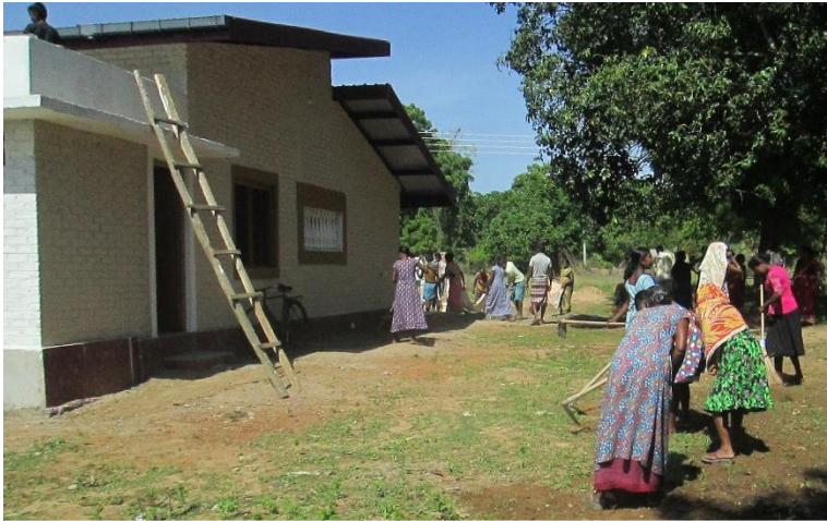
Residents engaged in cleaning the community centre grounds.