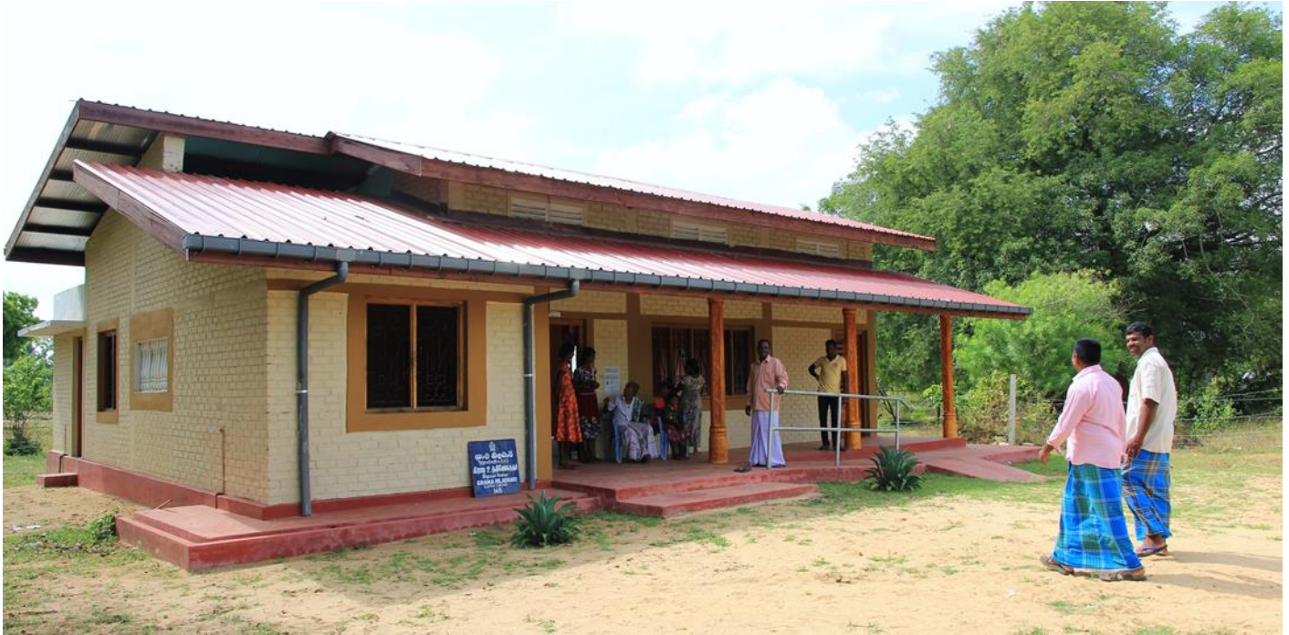
Illupadichchenai Community Centre, Batticaloa district.

Community centres are an important element of village life in Sri Lanka. They are used for events, village level administration, to disseminate public information and to conduct public meetings and regular health clinics for residents. The lack of such an indoor space in a village can cause serious inconveniences to communities. In 2014, with funding from the Improving Living Conditions in Returnee Areas of Sri Lanka through Housing Project , a new community centre was constructed through a participatory process in the Grama Niladhari (GN) division of Illupadichchenai in Batticaloa district.