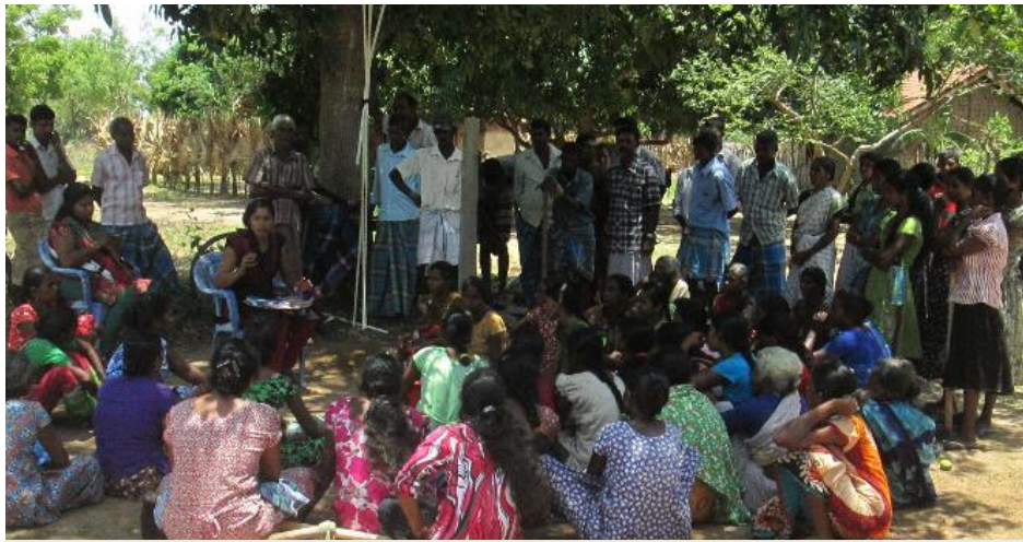
Community meetings were held outdoors as the village lacked a common building.

residents followed by livestock farming and daily wage labour. As this village had no resources to build their own community centre, meetings and events were held outdoors, most often under a tree.