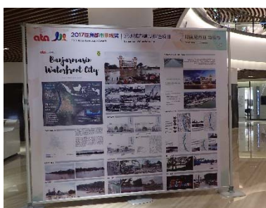
Panel of Banjarmasin, Indonesia

Besides this year’s awarded projects’ presentation, a representative from the past winners showed his city’s progress after the award. This ceremony was not only a networking event among winners but also a good opportunity to learn from the past and other projects at each other.