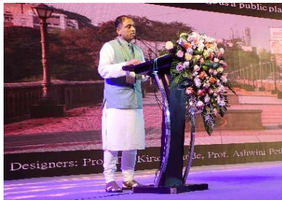
Presentation of Pune, India

In the past 7 years, a total of 79 projects from 12 countries have been awarded. This year, 53 projects from 8 countries applied to the ATA and 15 of them received the awards. From South East Asian region, 4 projects from India, Indonesia and Vietnam were awarded.