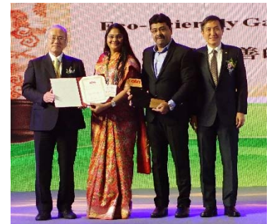
Surat, India at the ceremony

Yinchuan, China, 28 September 2017 – The 8 th Asian Townscape Awards (ATA) Ceremony was held in Yinchuan, China on 28 September. The Awards were established in 2010 as an initiative toward the goal of “materializing a living environment that is happy and fulfilling to the people of Asia”, by co-hosting 4 organizations; UN-Habitat Regional Office for Asia and the Pacific, Fukuoka Urban Research Centre, Asian Habitat Society and Asia Townscape Design Society.