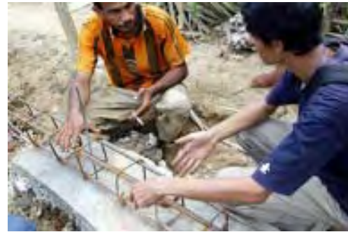
A tsunami survivor manages his house construction.

On an action level, the ROAP-Fukuoka's technical cooperation programmes and projects span the entire spectrum of urbanisation, shelter delivery, and poverty reduction issues. These include human settlements development, especially housing, slum upgrading, poverty alleviation, gender equity, urban governance, city and town development strategies, urban environmental planning and management, and post-conflict and post-disaster reconstruction and recovery.