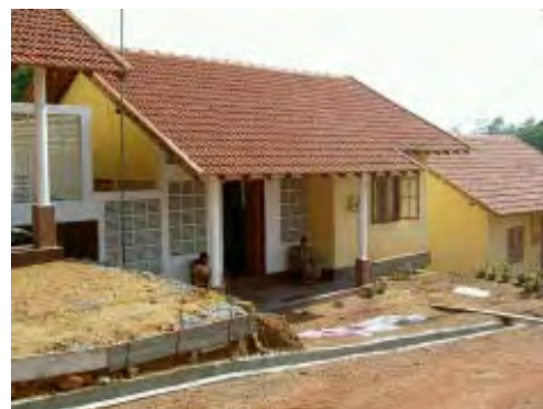
Community-managed housing construction in Sri Lanka.

As the following overview of its work shows, the ROAP-Fukuoka works primarily with the people whom it is helping – the urban poor, the returning refugees, and the disaster survivors – to ensure more capable, committed and empowered communities emerge to sustain the various shelter and environmental improvements resulting from its projects and programmes.